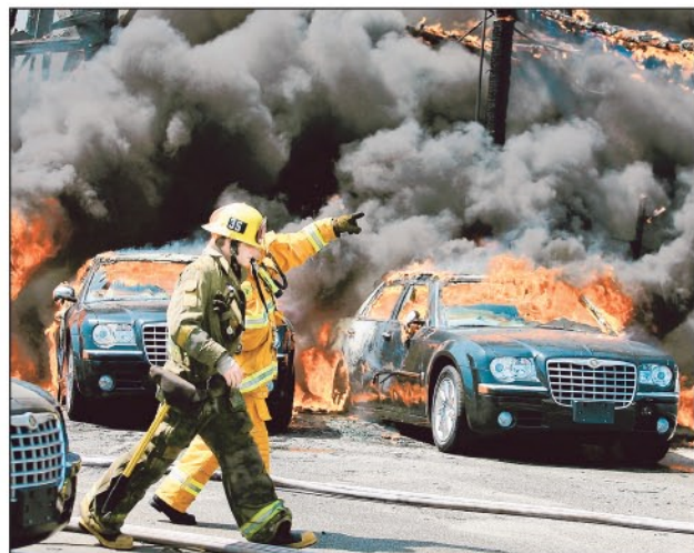
A fire at an abandoned storage facility in May 2007 spread to a holding area for new cars, destroying thousands of dollars' worth of stock belonging to Star Chrysler and Jeep.