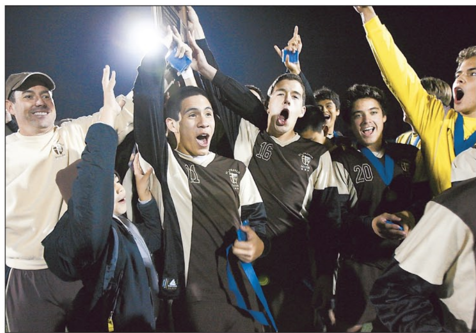
St. Francis High players celebrate winning the CIF Division II Southern California Regional Championships in 2009.