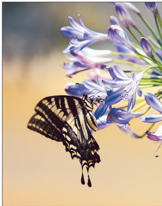
A Western Tiger Swallowtail Butterfly mingles with the flowers at Brand Library in June 2008.