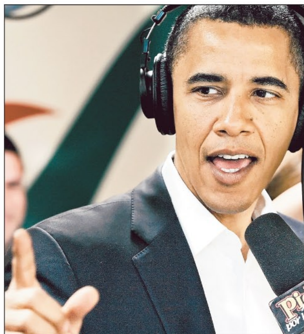
Barack Obama gives a radio interview with Eddie "Piolin" Sotello of KSCA, La Nueva, 101.9 FM in 2007.